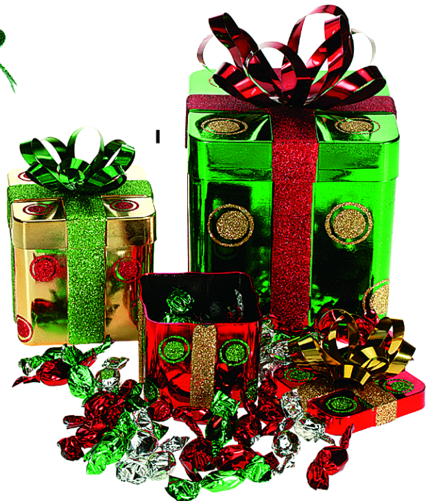
I. 36-93884 WHIMSICAL BOXES 4-8" S3 PLASTIC