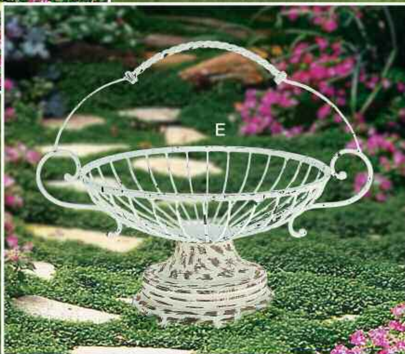
E. 56-75100 FRENCHWIREROUNDBASKET8"