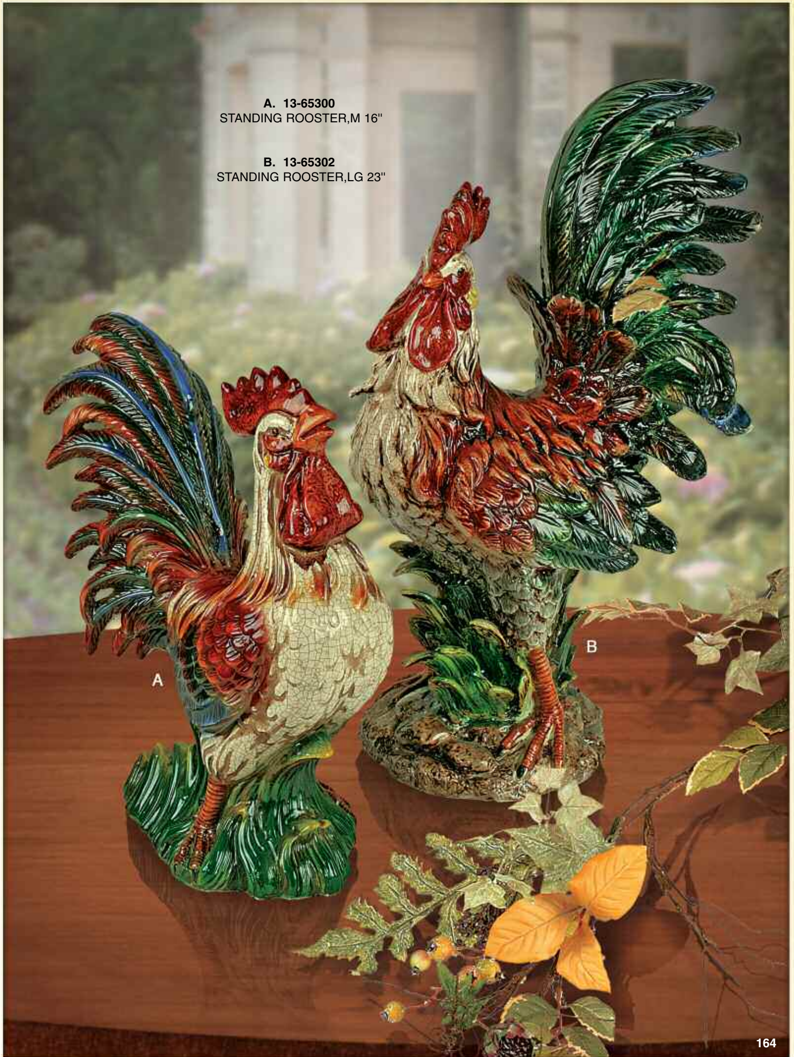
B. 13-65302 STANDING ROOSTER,LG 23"