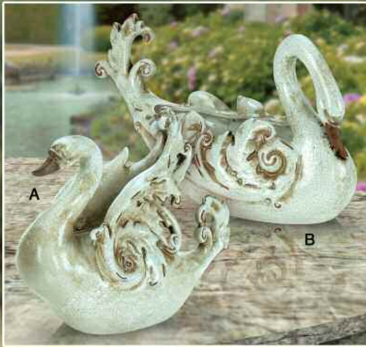
A. 29-84806 ACANTHUS SWAN 11"