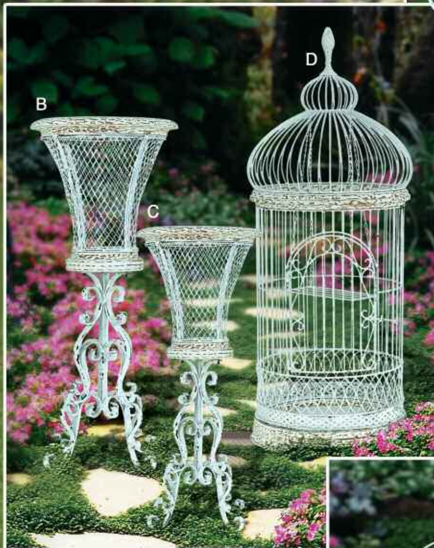
C. 56-75106 FRNCHWREPLNTRW/STND,S32"