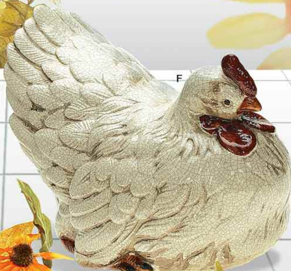
F. 13-14834 FRENCH HEN 13"