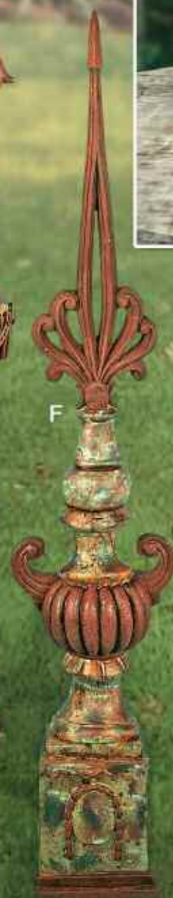
C. 29-64860 GRNDBUNTING GDNFNIAL80"