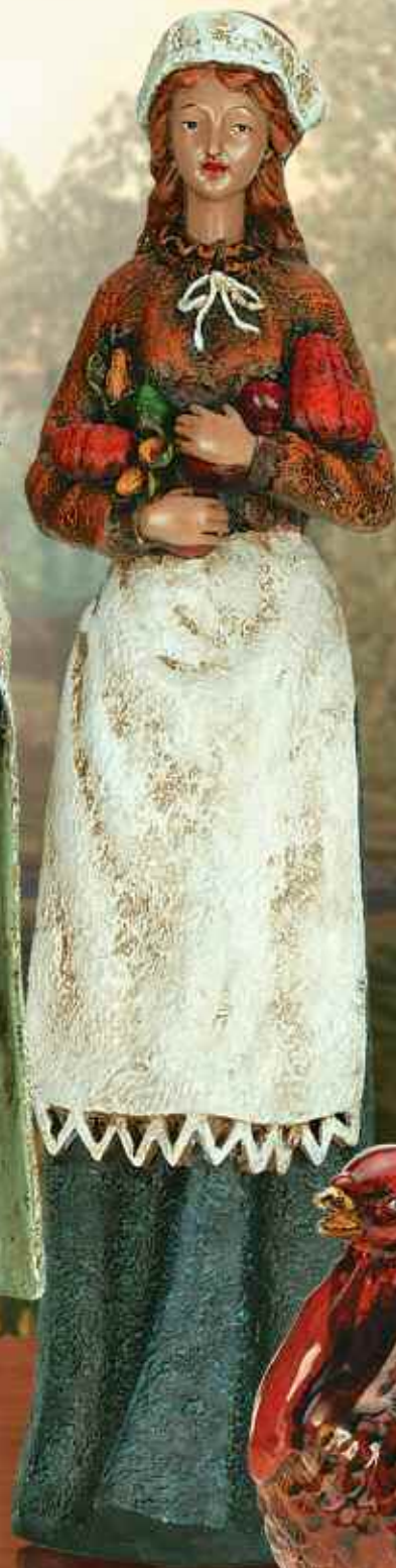
A. 29-84846 THNKSGVNGPILGRIMS28.5"A2