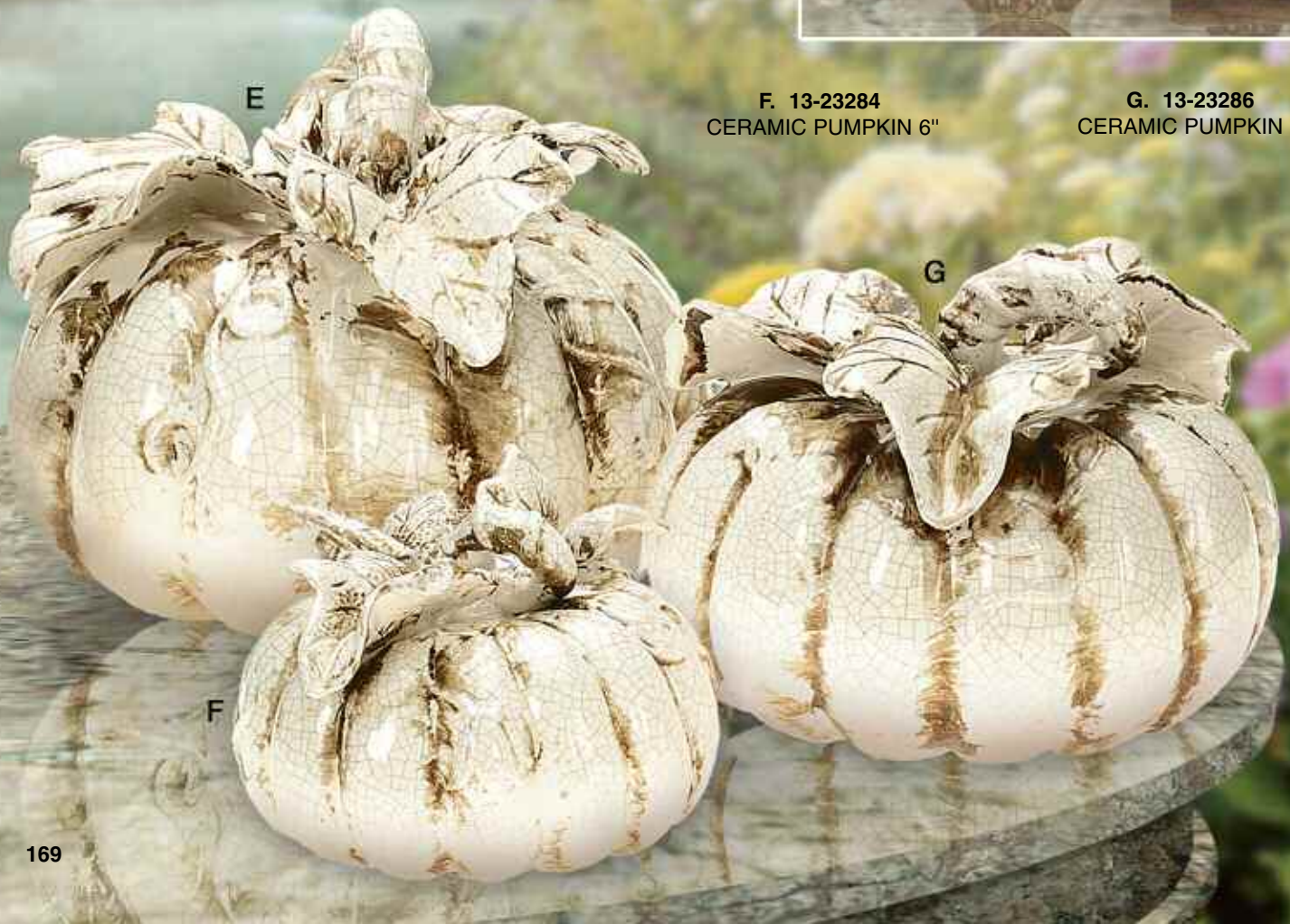
G. 13-23286 CERAMIC PUMPKIN 8"